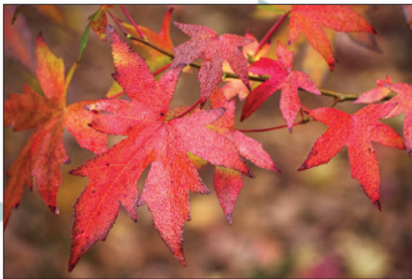
Sweet Gum leaves.