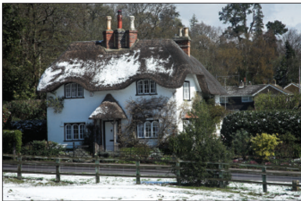
Beehive Cottage overlooks Swan Green.