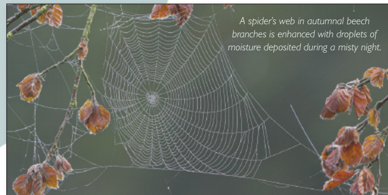
A spider's web in autumnal beech branches is enhanced with droplets of moisture deposited during a misty night.