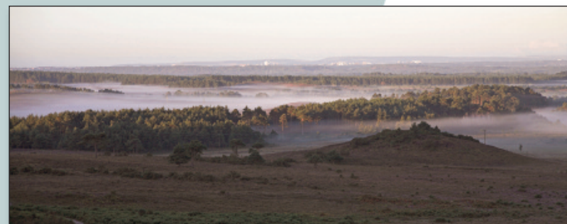
Viewed from Castle Hill near Burley, mist lies low across Cranes Moor National Nature Reserve on the western edge of the Forest. Bournemouth and the Purbeck Hills can be seen in the distance.