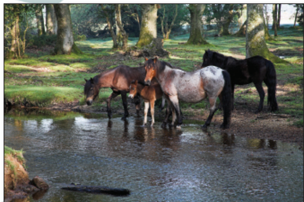
Ponies stand beside the Ober Water stream close to Ober Corner.