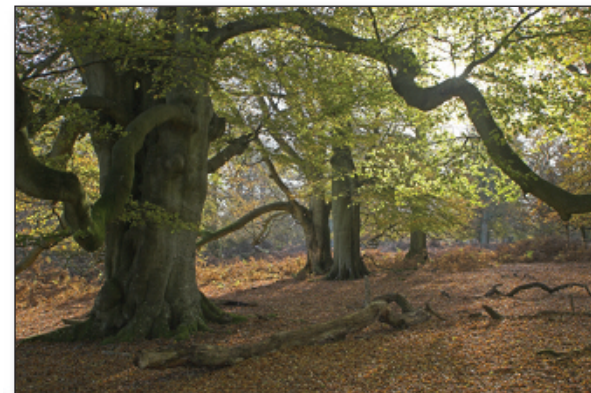
Bratley Wood hosts some fabulous trees but every visit, even to a familiar location, reveals something different.